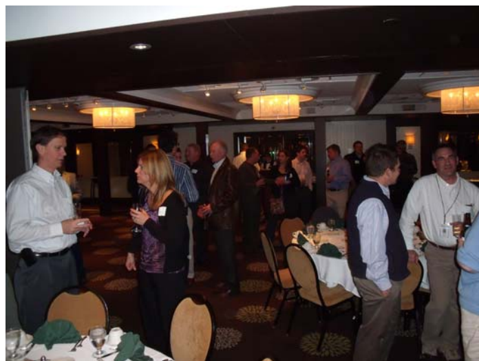
Members and students visiting during the social hour before dinner and the presentations.